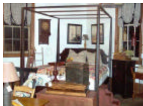
Pencil post beds, in King, Queen, and Full sizes are available in a dozen colors.

On Friday evening, December 12th, four of the area shops will be open in the evening for their customers to enjoy not only extended shopping hours, but also to enjoy the season's display of lights and decorations. The theme this year for this event is "Christmas By Candlelight".